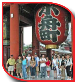
Daibutsu (Great Buddha) in Kamakura, Tour Group at Senso-ji Temple