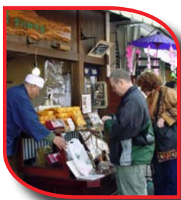
From Top to Bottom: Snow monkeys in Jigoku-dani, Path through forest in Kamikochi, Tour group at Takayama Morning Market