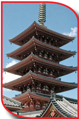
Photos Top to Bottom: Tower in Ginza at Night, Shinkansens (Bullet Trains) at the Tokyo Train Station, Senso-ji Temple