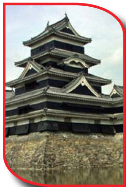
From Top to Bottom: Nakamise-dori Shopping Arcade, Matsumoto Castle