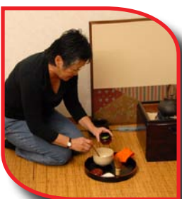
Imperial Palace in Kyoto, Kyoto Geisha, Tour member participating in Authentic Tea Ceremony