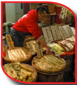
Photos Top to Bottom: Tower in Ginza at Night, Atomic Bomb Dome in Hiroshima, Shinkansens (Bullet Trains) at the Tokyo Train Station Nishiki-koji Open Air Market, Kyoto